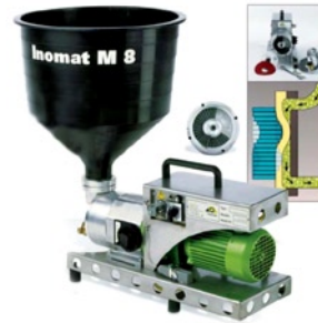
Pump-mixer and injection tube for mechanical application.