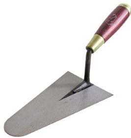
Trowel and plasterboard for manual working.